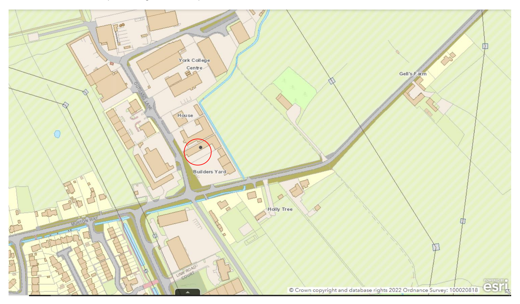
Annex 5 - Map showing location of premises