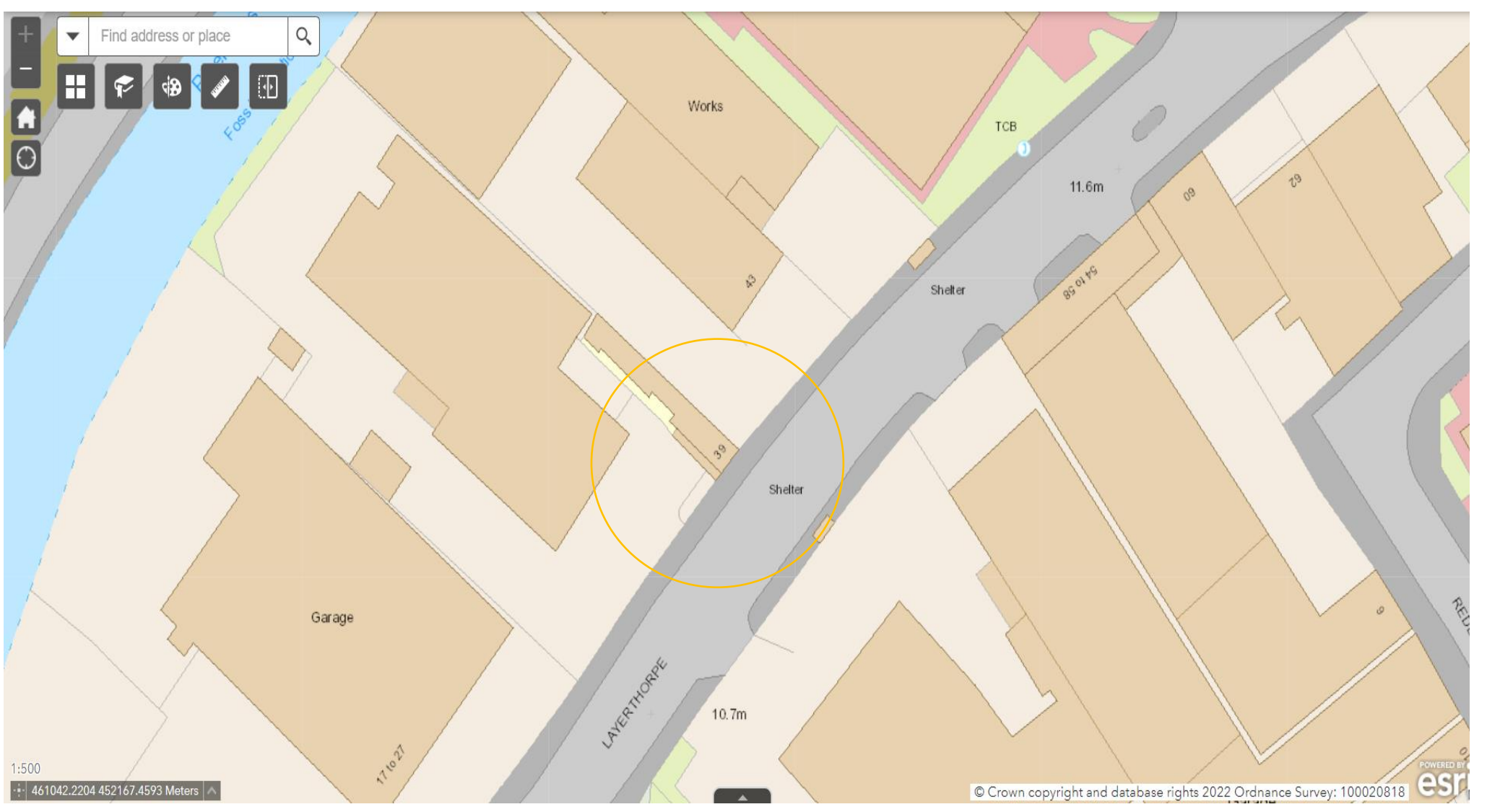
Annex 5 - Map showing location of premises.